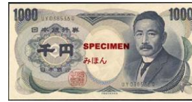
1000 Yen ( Old )