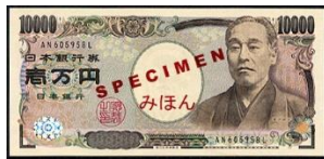
10000 Yen ( New )