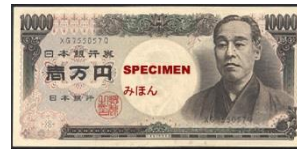
10000 Yen ( Old )