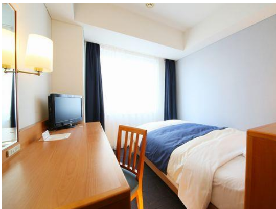
Yokohama Sakuragi-Cho Washington Hotel