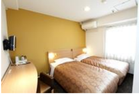
Yokohama Heiwa Plaza Hotel