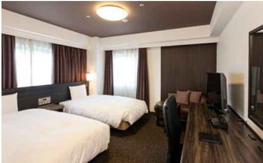
Daiwa Royal Hotel Yokohama-Koen