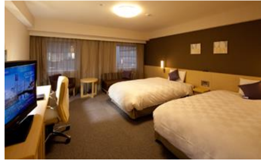
Daiwa Royal Hotel Yokohama-Kannai