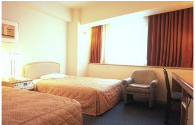
Yokohama Isezaki-cho Washington Hotel