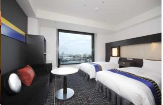
Hotel New Otani Inn Yokohama