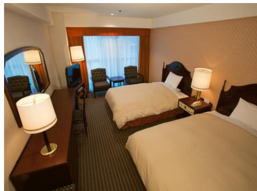
Rose Hotel Yokohama