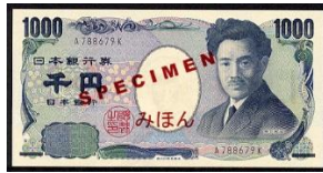
1000 Yen ( New )