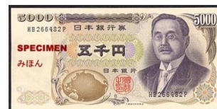
5000 Yen ( Old )