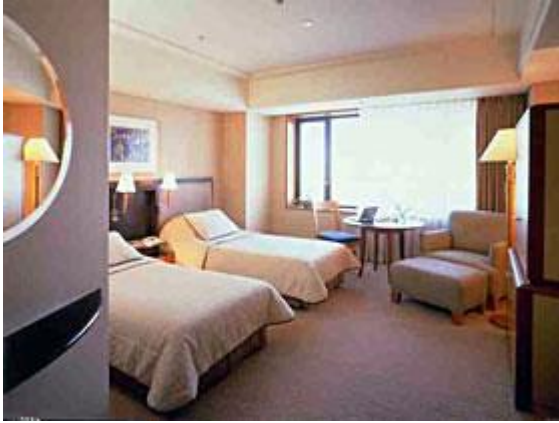
The Yokohama Bay Hotel Tokyu