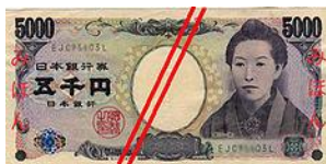
5000 Yen ( New )