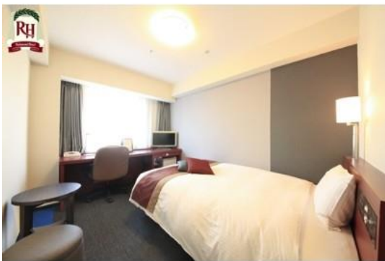
Richmond Hotel Yokohama Basha-michi